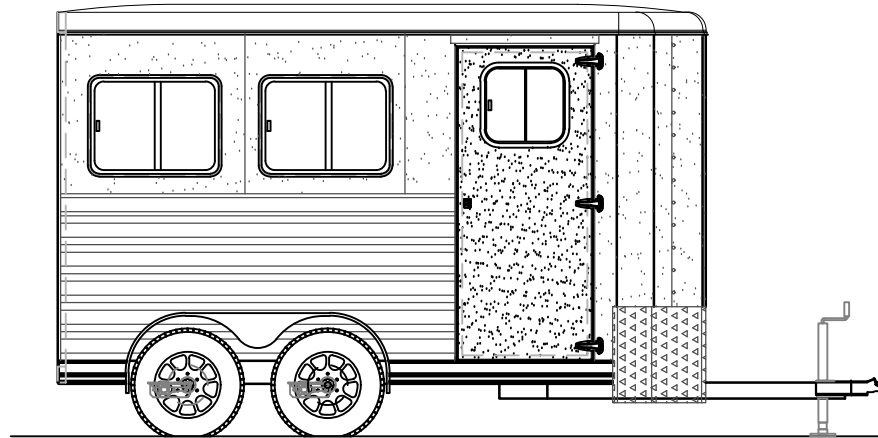
B CURB SIDE VIEW SCALE: 1/4" = 1'-0"